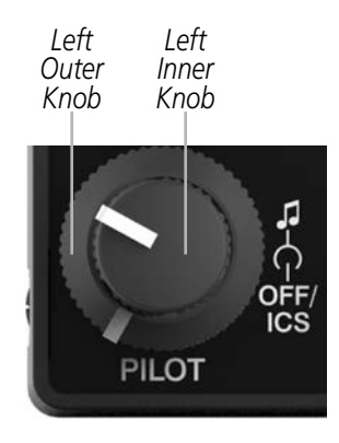
Left Knob - Pilot Volume Controls