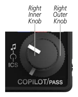
Right Knob - Copilot and Passenger Volume Controls